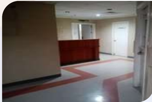
2 nd Floor (307.48 sqm)