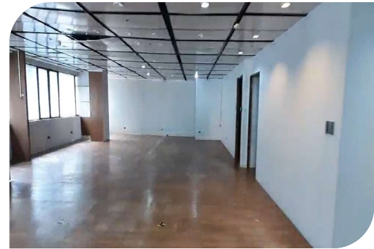
6 th Floor (368 sqm)