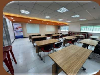
Training / Conference Room