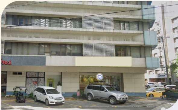
Ground Floor (233.96 sqm)

Dela Rosa cor. Legazpi Street, Legazpi, Makati City