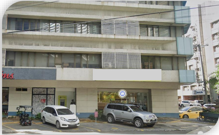
Ground Floor (228 sqm)

Dela Rosa cor. Legazpi Street, Legazpi, Makati City