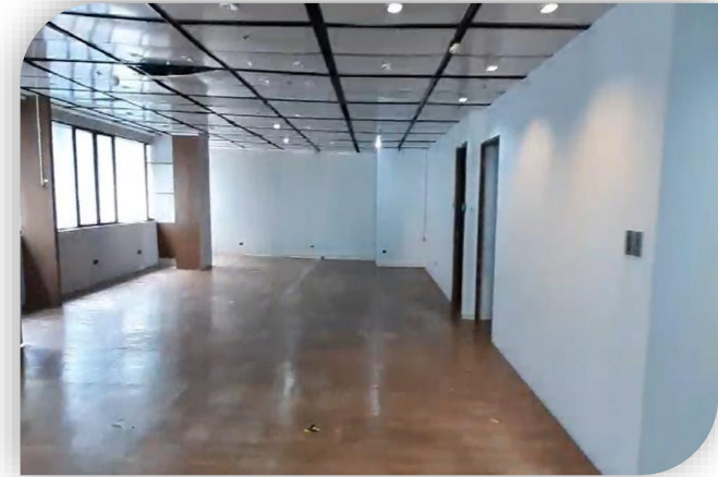
6 th Floor (368 sqm)