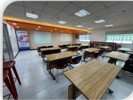
Training / Conference Room