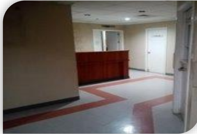
2 nd Floor (307.48 sqm)