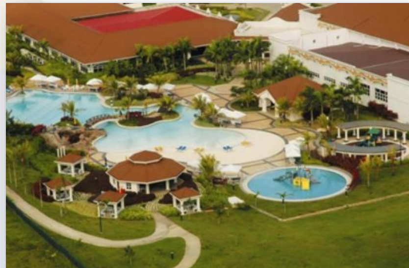
The Eagle Ridge Golf and Country Club

Eagle Ridge Golf and Residential Estates is a 700-hectare golf community and residential estate in General Trias, Cavite. It is considered as one of the largest golf and residential developments in the country and features 4 Residential Enclaves, 4 Champion Golf Courses, 5 Clubhouses, a Town Center, and Golf Villas.